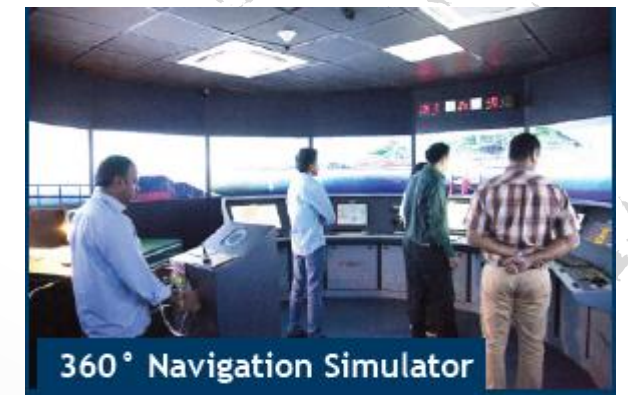
360° Navigation Simulator