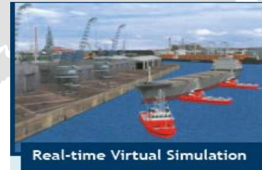
Real-time Virtual Simulation